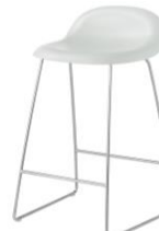
// White Cloud