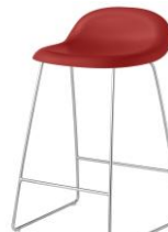
// Shy Cherry