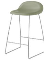
// Mistletoe Green