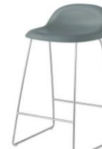
// Rainy Grey