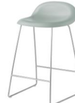
// Nightfall Blue