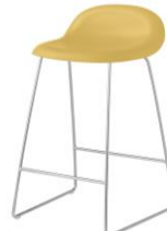
// Venetian Gold