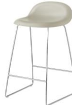
// Moon Grey