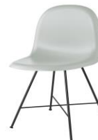
// Nightfall Blue