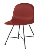
// Shy Cherry