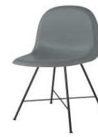
// Rainy Gray