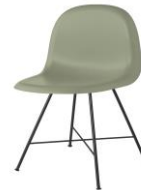
// Mistletoe Green