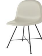
// Moon Gray