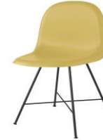
// Venetian Gold