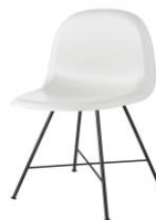
// White Cloud