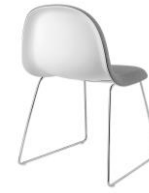
// White Cloud