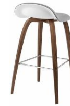
// White Cloud