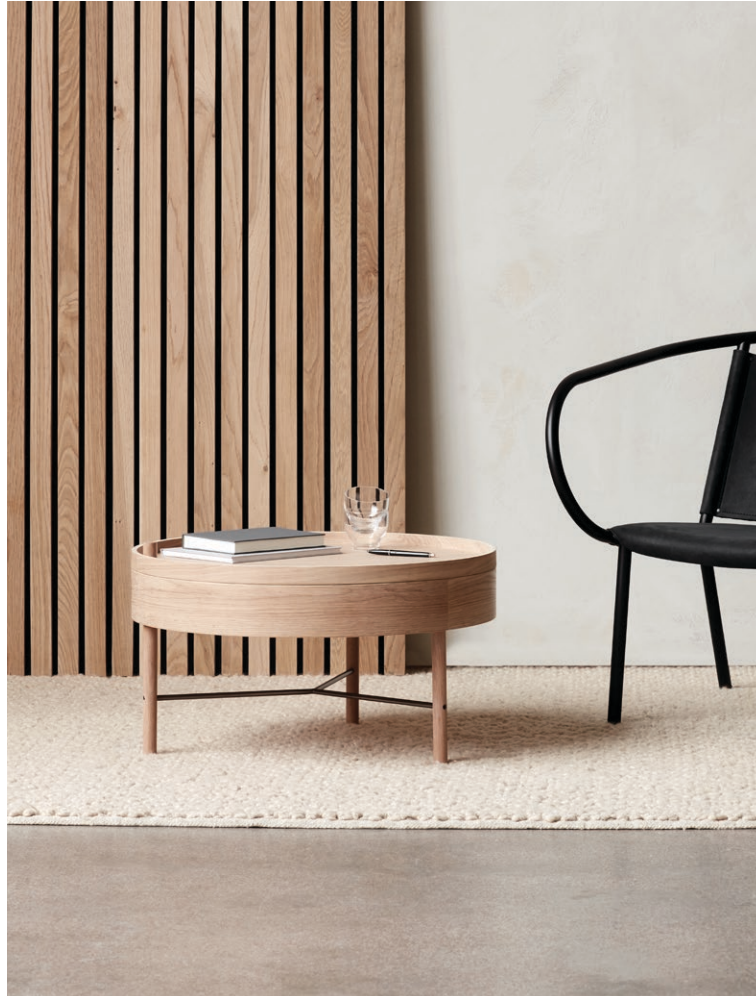
TURNING TABLE Designed by Theresa Rand