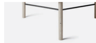
WHITE OAK / BLACK CHROME