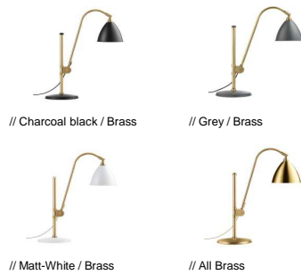
// Charcoal black / Brass