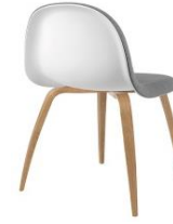
// White Cloud