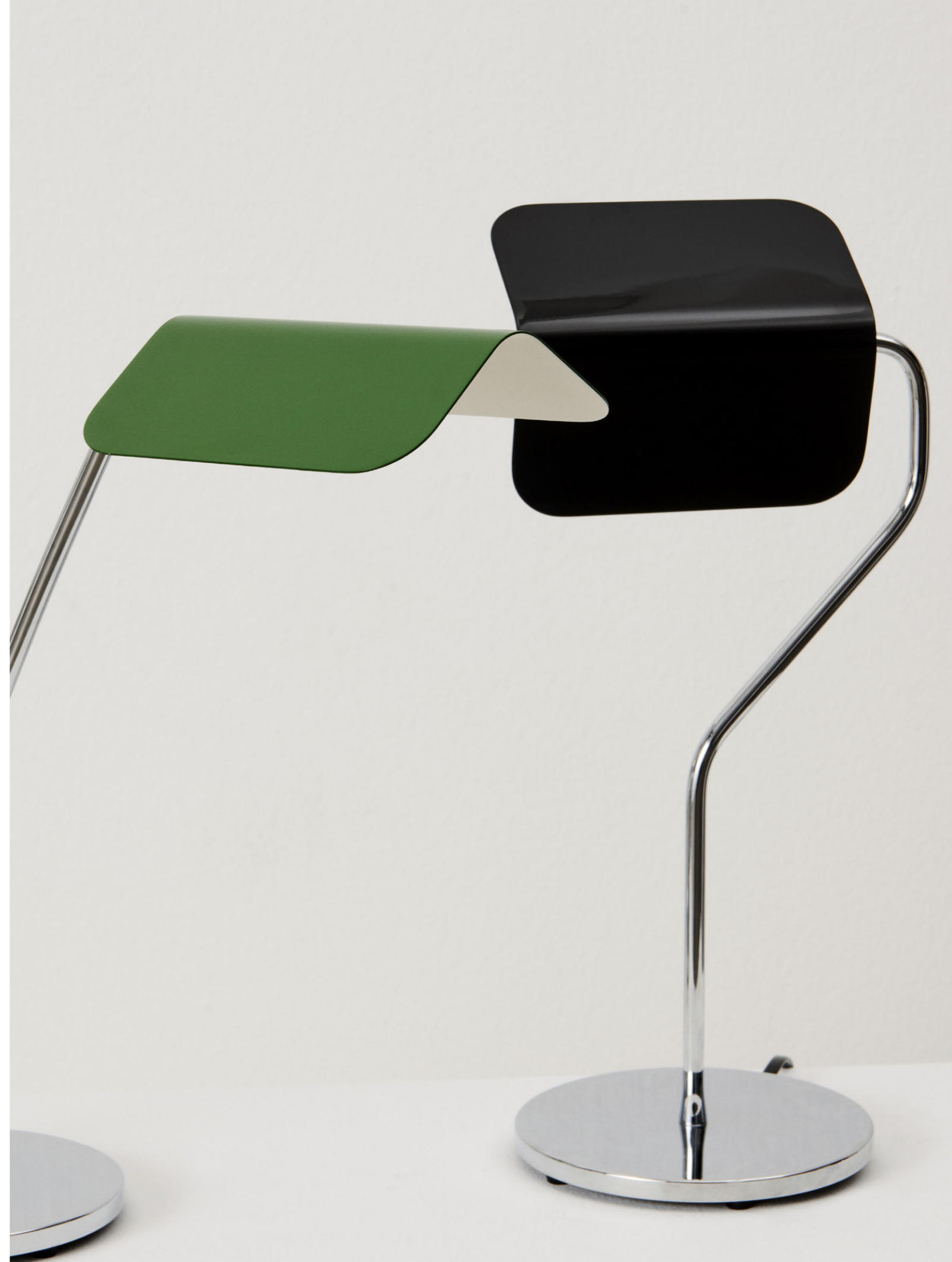
Apex Desk Lamp | Emerald green & Iron black