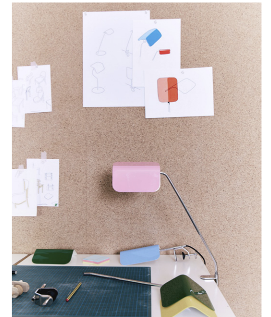
Colour is used as a key element in the folded steel shades, creating strong and colourful graphic shapes.