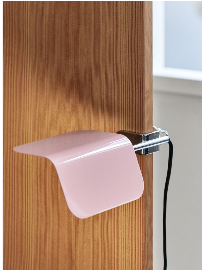
Apex Clip Lamp | Luis pink

Focusing on colour as a core element of the design, Apex's distinctive folded steel shade uses vibrant tones to create a graphic contrast to the chrome-plated bases. Available in several different models – the Clip Lamp, Desk Clip Lamp, Desk Lamp, and Table Lamp – there is an Apex member that caters to every space and situation, from a task light in a workspace to an ambient lamp in the bedroom.