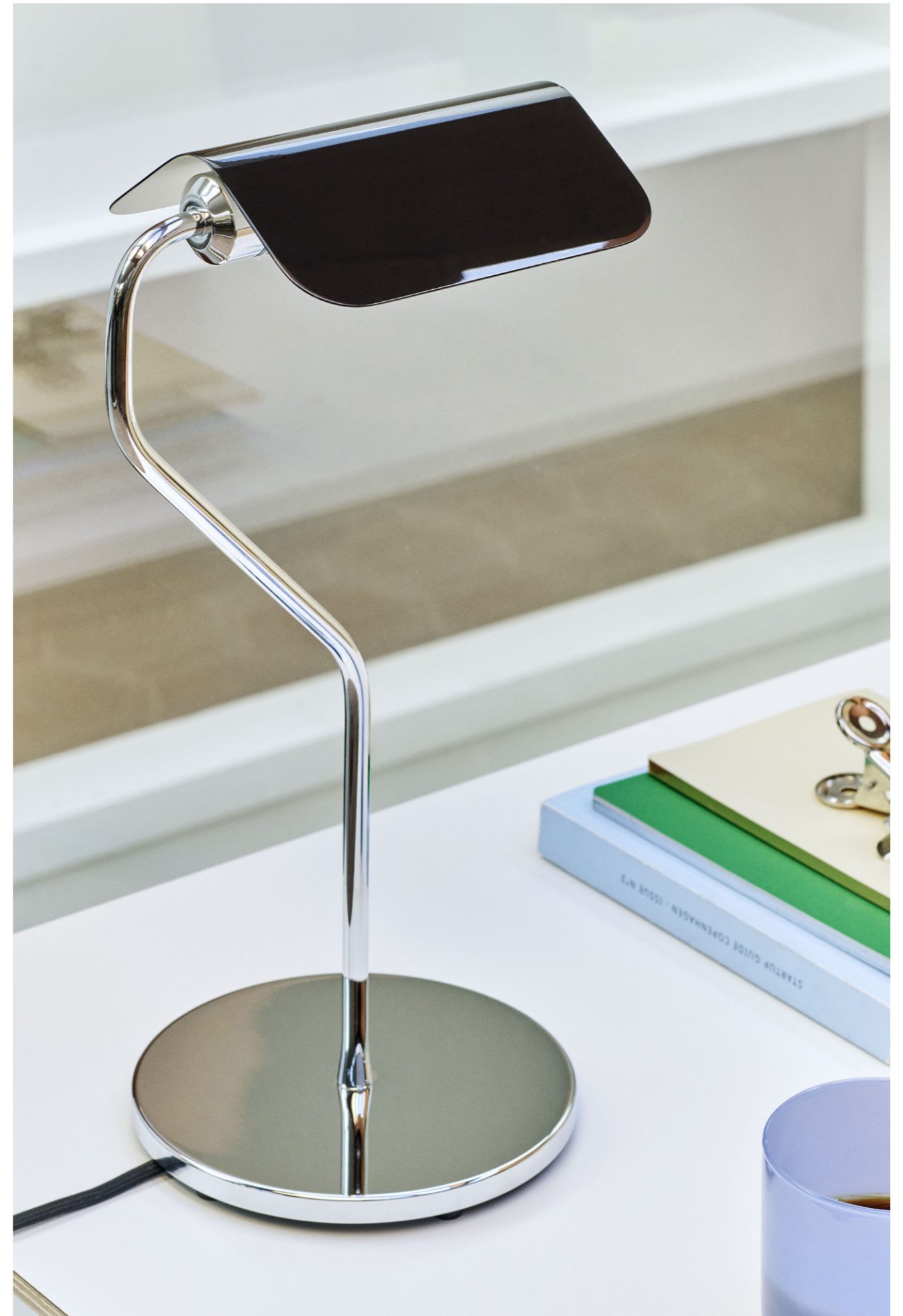
Apex Table Lamp | Iron black