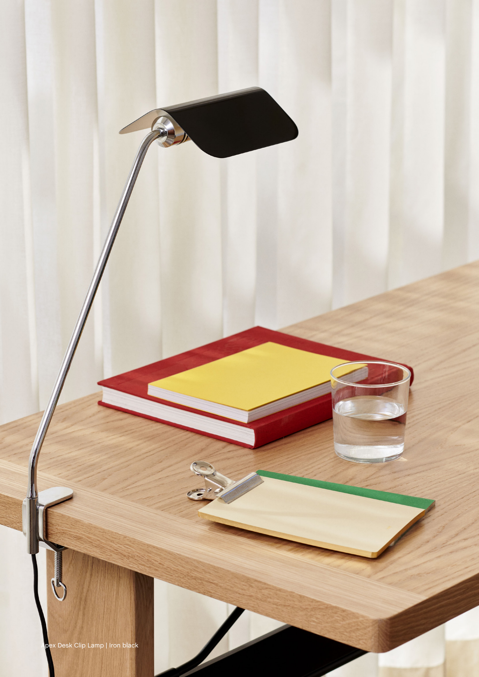
Apex Desk Clip Lamp | Iron black