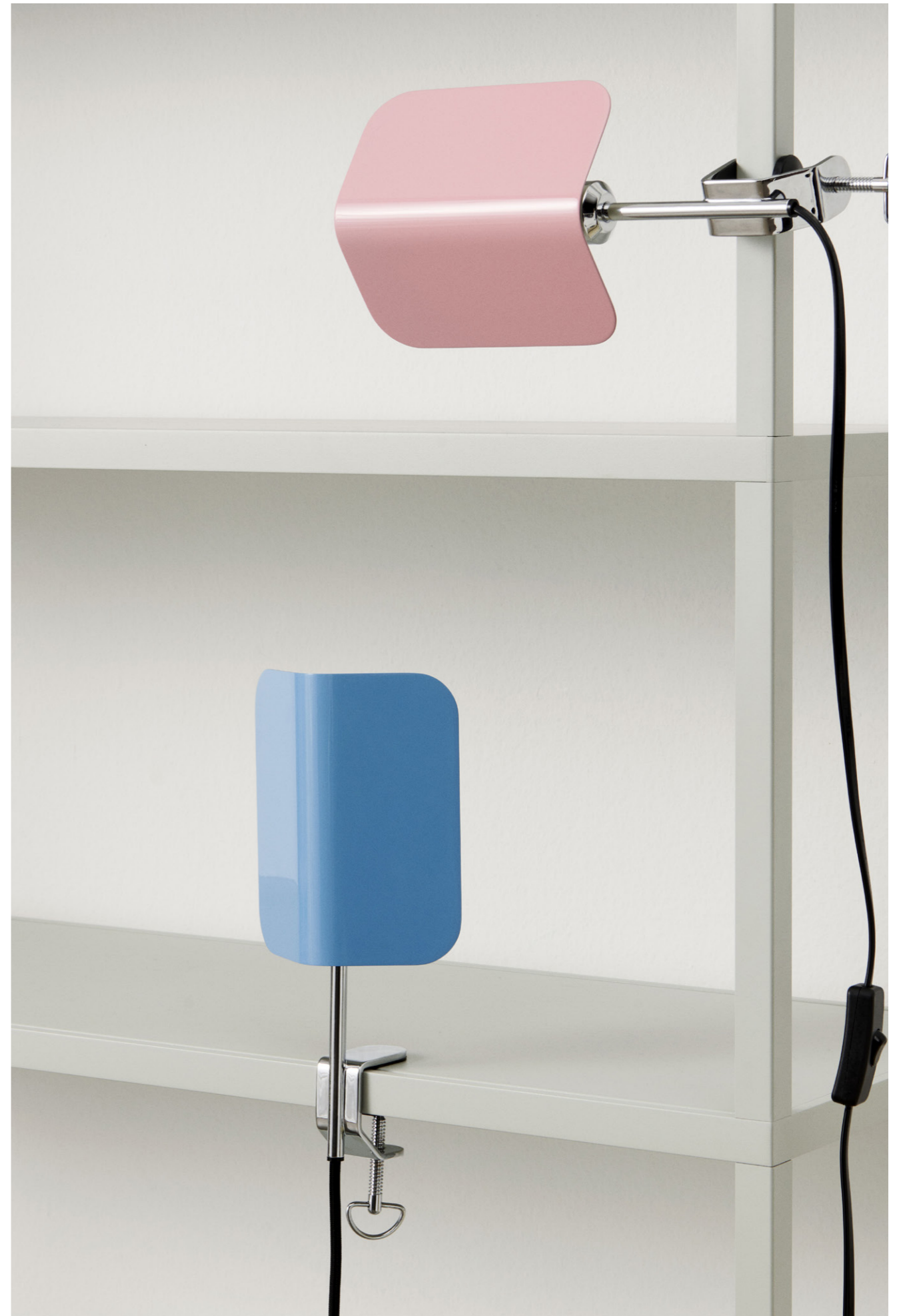
Apex Clip Lamp | Pastel blue & Luis pink