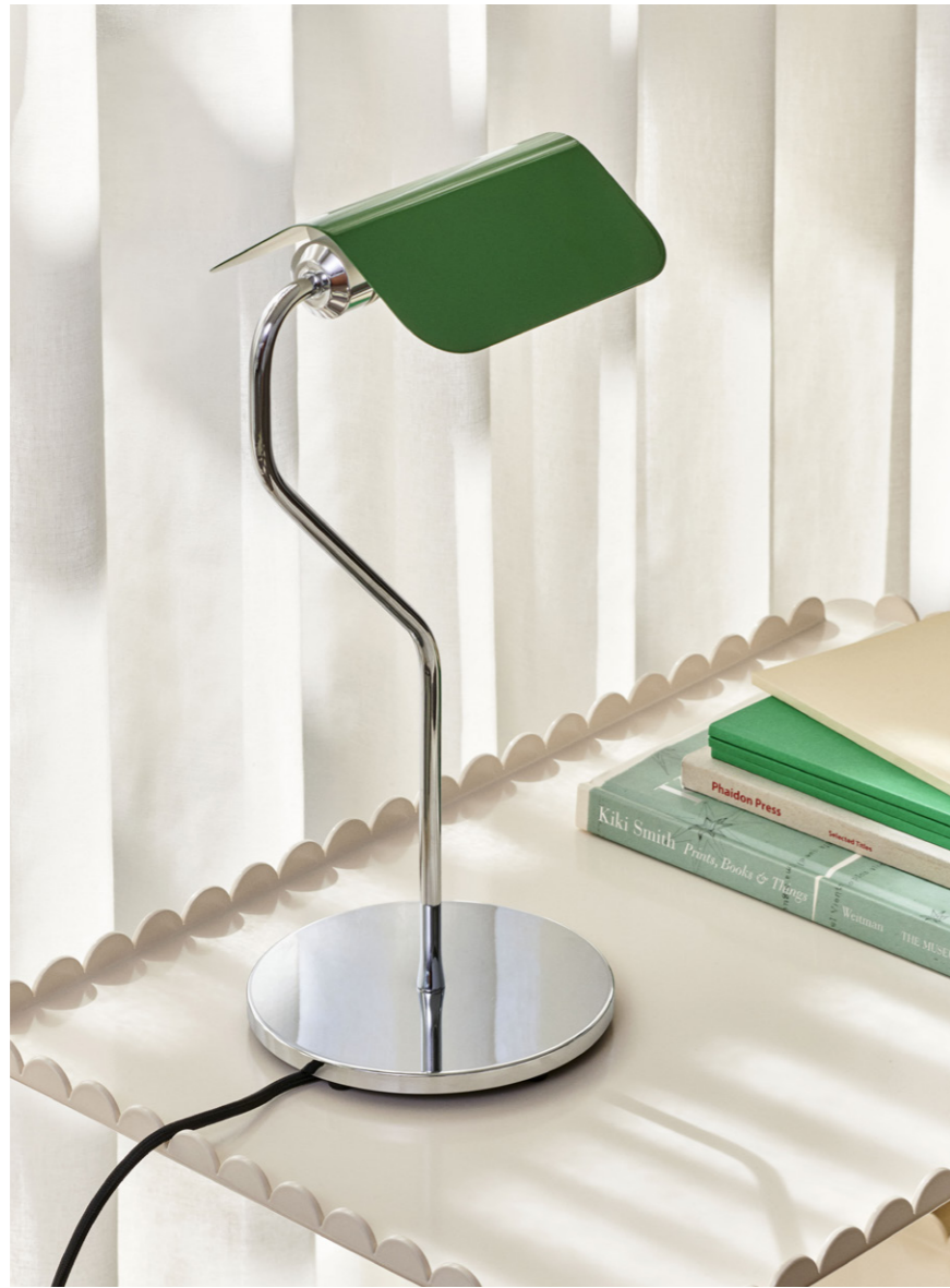
Apex Table Lamp | Emerald green