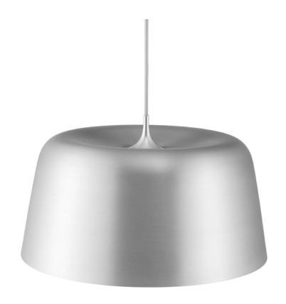
Tub Lamp Ø44 H: 21,5 x Ø: 44 cm